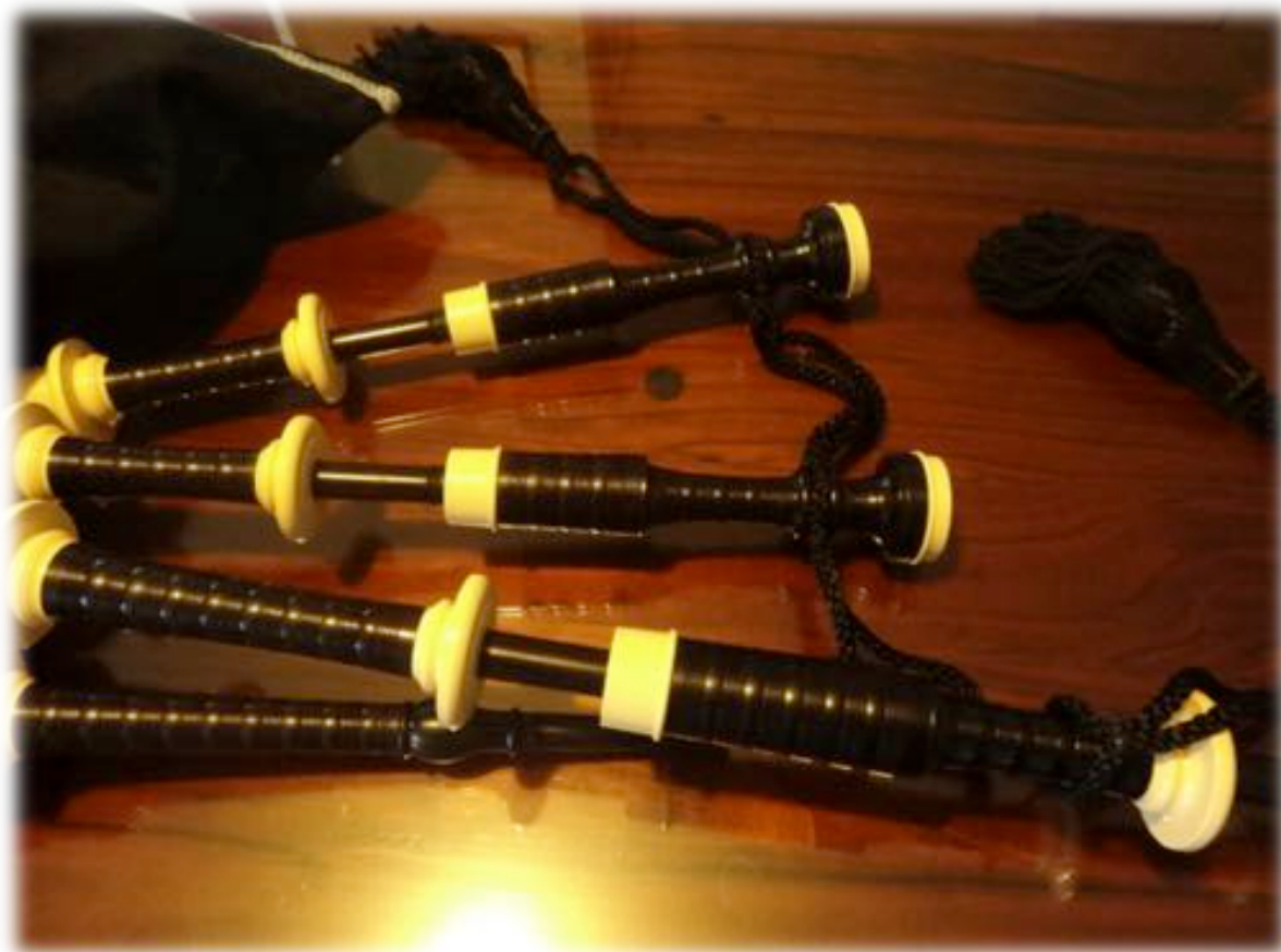
Classic profile of the McRae SL3 drones.

We tried several variations of reeds and all went well in the drones. Not only sounding nice, but also performing well for starts, stops, back pressure, double tones etc. We have no doubt these will be a very popular bagpipe.