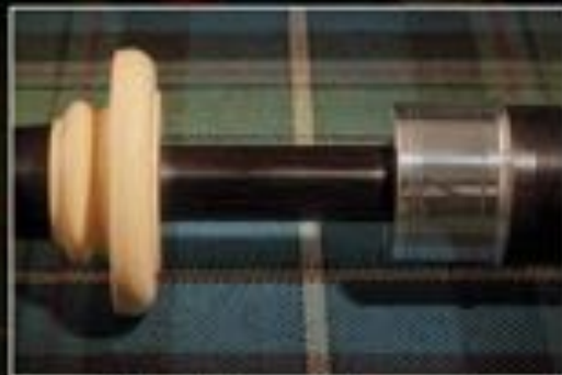
SL2: Imitation ivory projecting mouse and blackwood slides with plain alloy ferrules