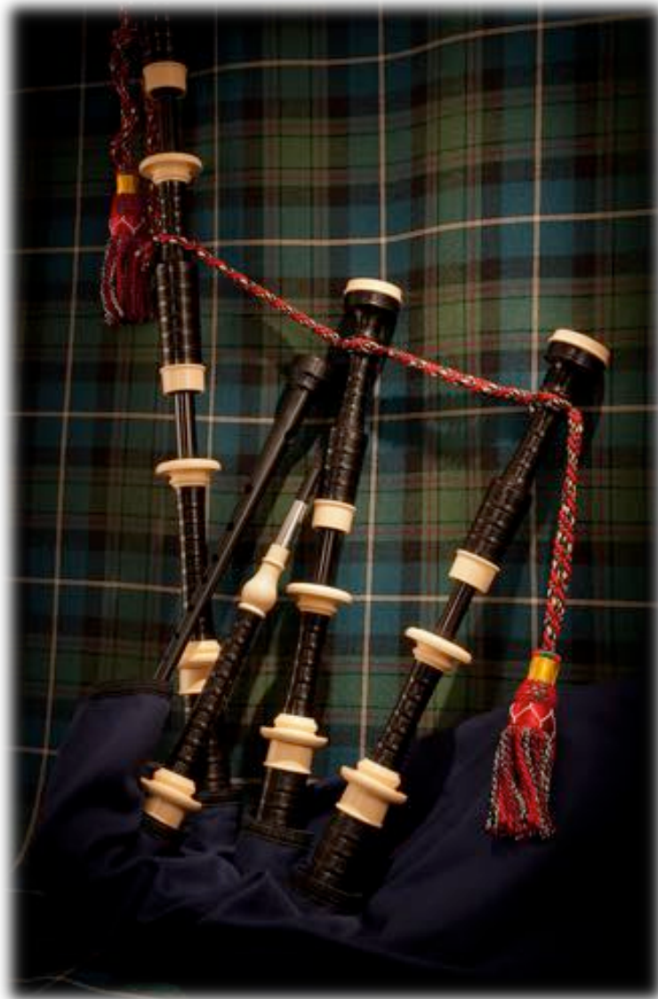
Full imitation ivory and blackwood, SL3 McRae bagpipe.