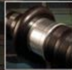
SL1: Blackwood projecting mouse with plain alloy ferrules