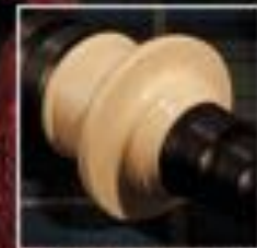
SL3: Imitation ivory projecting mouse and ferrule