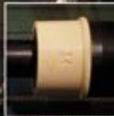
SL3: Imitation ivory ferrule with blackwood slides