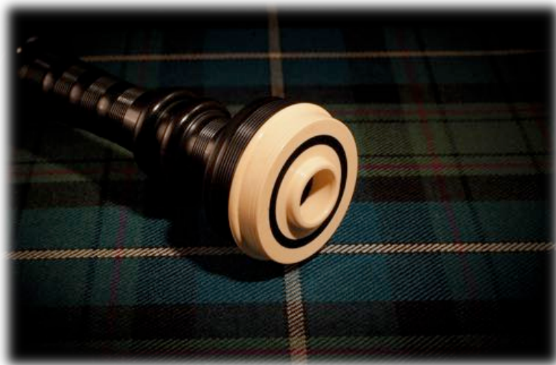
McRae SL3 showing cord guides and beading.

The pipes were very easy to set up. Alterations to reeds to meet a modern pitch were not required and the reeds went straight in out of the box. The sound produced was well balanced, a really good drone volume and the type of sound you would expect from Stuart Liddell's bagpipe. It is a faithful and accurate reproduction.