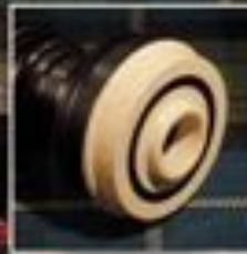
SL1, SL2, SL3: Imitation ivory ring cap