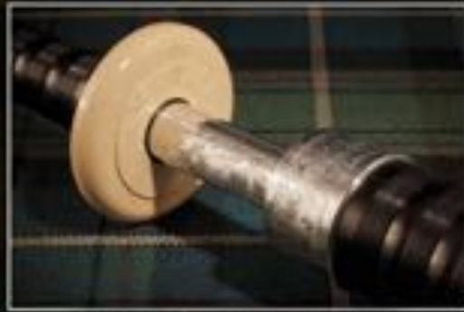
SL4: Thistle engraved alloy ferrule and slide with imitation ivory projecting mount

The Duncan MacRae bagpipes by Stuart Liddell are available in four options: SL1, SL2, SL3 and SL4 as shown here.