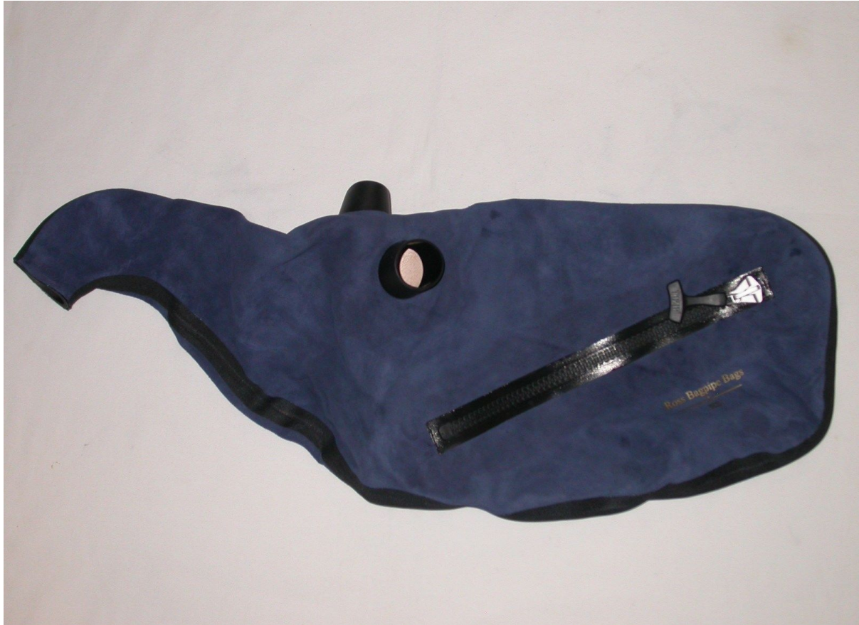
New Ross Breathable Leather Pipe Bag.

The makers of Ross Bagpipe bags have now developed a new product. It is a new leather bag that they say is more breathable and will be an improvement on the old artificial suede style bag. The bag certainly looks excellent in a stunning new blue colour.