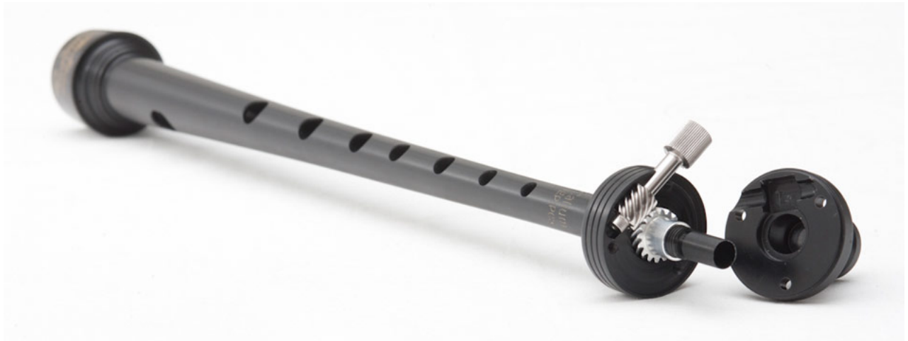
Internal workings of the Campbell Chanter