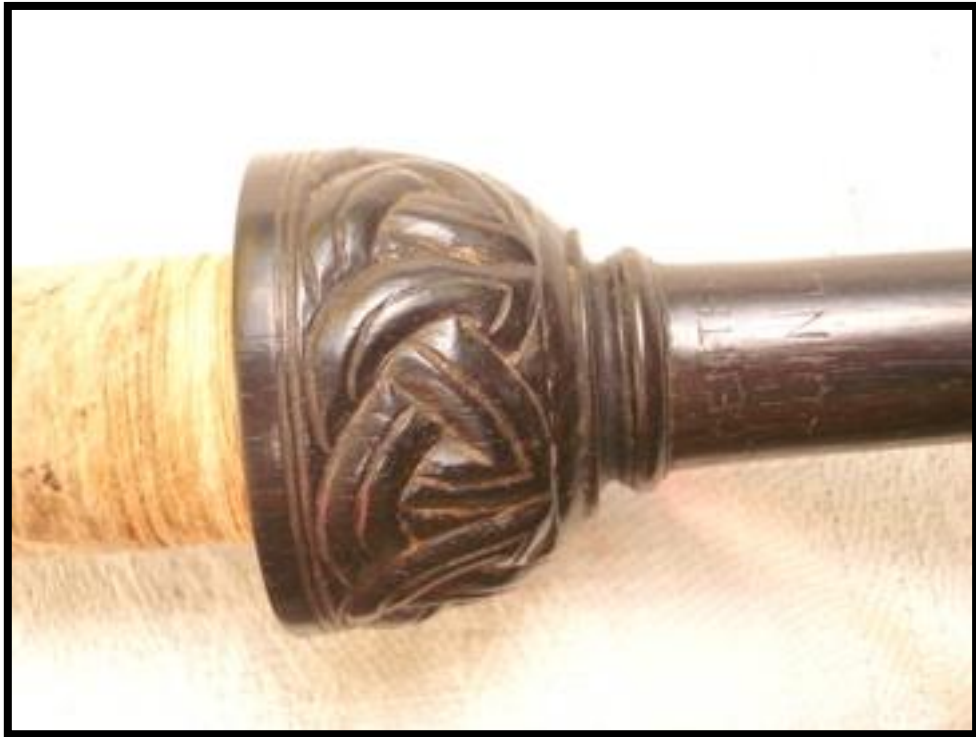
Chanter bulb with makers stamp