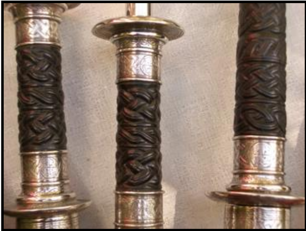
Lower drone sections