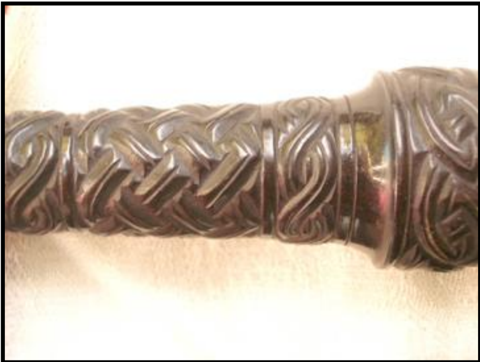
Ornate carving on all timber